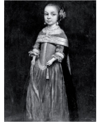
Fig 3. Attributed to Caspar Netscher, Portrait of Suzanna Everwijn (1654–1733) , ca. 1658, oil on copper, 28 x 22.5 cm, present whereabouts unknown (D. J. G. Durman Collection, Arnhem, 1971)

Netscher completed the series by painting the portraits of the younger