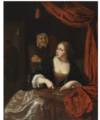
Fig 20. Jan van Mieris, Courtesan Counting Money , ca. 1680, oil on panel, 28.4 x 22.6 cm, The Leiden Collection, New York, inv. no. JM-101.