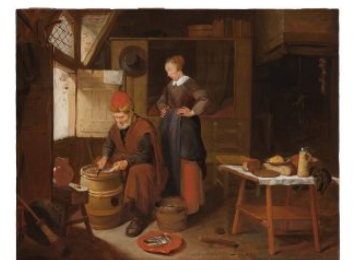
Fig 12. Quiringh van Brekelenkam, Fisherman and His Wife in an Interior , 1657, oil on panel, 47 x 60.3 cm, The Leiden Collection, New York, inv. no. QB-100.