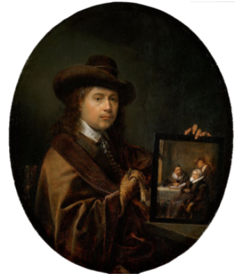
Fig 4. Gerrit Dou, Self-Portrait Holding a Portrait of His Parents and Brother , ca. 1649, oil on oval panel, 27 x 23 cm, Herzog Anton Ulrich-Museum, Braunschweig, inv. no. GG 303.

Leiden painters found their most important new patrons among burghers, particularly for portraiture ( fig 5 ) and ( fig 6 ). While burghers only rarely commissioned portraits of themselves before 1600, they did so with increasing