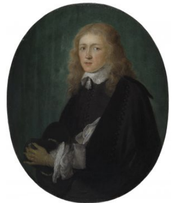
Fig 5. Gerrit Dou, Portrait of Dirck van Beresteyn , ca. 1652, oil on oval silver-copper alloy, 10.2 x 8.2 cm, The Leiden Collection, New York, inv. no. GD-111.