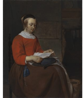
Fig 13. Gabriel Metsu, Young Woman Seated in an Interior, Reading a Letter , ca. 1658–61, oil on panel, 25.8 x 21 cm, The Leiden Collection, New York, inv. no. GM-103.

For example, the majority of Van Staveren's paintings belonged to a single owner who, moreover, was related to him: the clergyman Eduard Westerney,