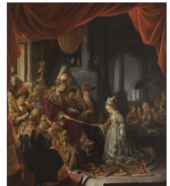
Fig 8. Jan Adriaensz van Staveren, Esther Before Ahasuerus , ca. 1640–45, oil on panel, 86.7 x 75.2 cm, The Leiden Collection, New York, inv. no. JvS-100.