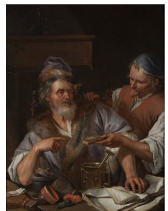
Fig 18. Jacob Toorenvliet, Alchemist , 1684, oil on copper, 31.6 x 25.3 cm, The Leiden Collection, New York, inv. no. JT-107.