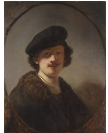
Fig 2. Rembrandt van Rijn, Self-Portrait with Shaded Eyes , 1634, oil on panel, 71.1 x 56 cm, The Leiden Collection, New York, inv. no. RR-110.