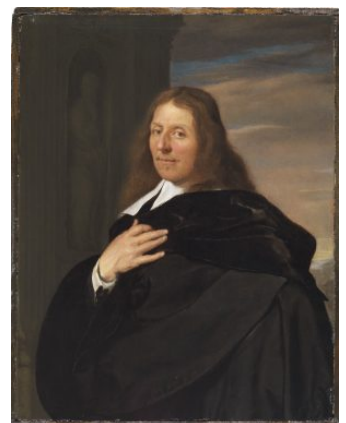
Fig 6. Frans van Mieris, Portrait of a Fifty-Two Year Old Man , 1665, oil on panel, 19.2 x 15 cm, The Leiden Collection, New York, inv. no. FM-104.