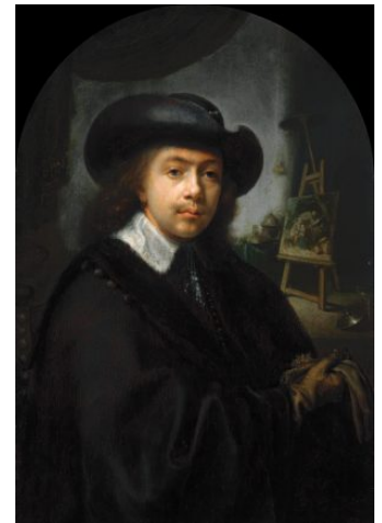
Fig 7. Gerrit Dou, Self-Portrait , ca. 1645, oil on panel with arched top, 12.4 x 8.3 cm, Kremer Collection.

In 1642 Leiden artists once again sought to found a painter's guild, this time to protect local artists from competition from their compatriots. The painters were enraged that “diversche personen woonachtich in andere Steden ende