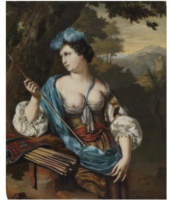
Fig 19. Willem van Mieris, Diana, Goddess of the Hunt , 1686, oil on panel, 18 x 14.4 cm, The Leiden Collection, New York, inv. no. WM-101.

The first fijnschilder to develop a personal style was Quiringh van Brekelenkam. [39] According to the anonymous eighteenth-century biographer, Van Brekelenkam followed Dou “op eene lughtige manier” (in a