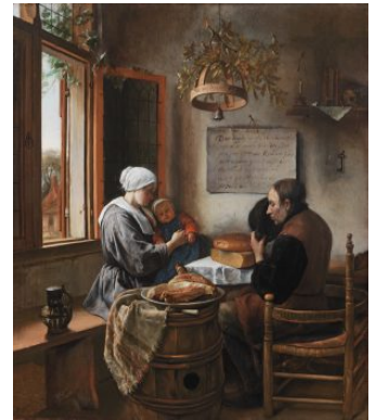
Fig 14. Jan Steen, Prayer Before the Meal , 1660, oil on panel, 54.3 x 46 cm, The Leiden Collection, inv. no. JS-116.