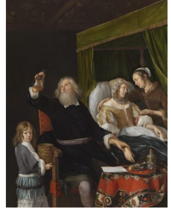
Fig 16. Jacob Toorenvliet, Doctor's Visit , ca. 1666–67, oil on copper, 52.3 x 41.3 cm, The Leiden Collection, New York, inv. no. JT-102.

Another possible explanation for the dearth of references to these artists in Leiden inventories is that the attributions of their works were not known. Then, as now, it would have been difficult for a notary's clerk to distinguish between the work of Van Spreeuwen, for example, and that of other Dou followers. Their paintings, particularly their genre scenes, may have been listed as