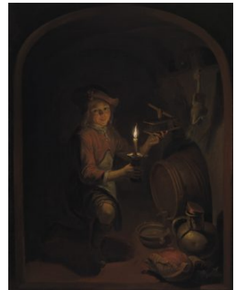
Fig 17. Domenicus van Tol, Boy with a Mousetrap by Candlelight , ca. 1664–65, oil on panel, 30 x 23.3 cm, The Leiden Collection, New York, inv. no. DT-100.