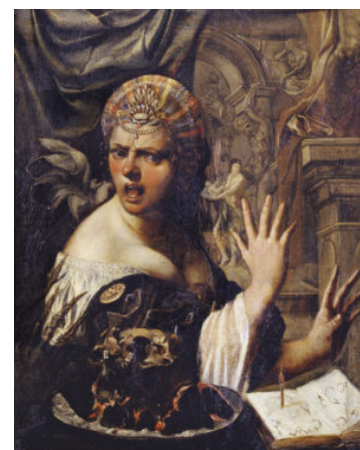
Fig 4. Angelo Caroselli, La Negromante , ca. 1625, oil on canvas, 44 x 35 cm, Pinacoteca Civica "F. Podesti" – Ancona

Too little is known of Van Laer's life to fully understand the psychological