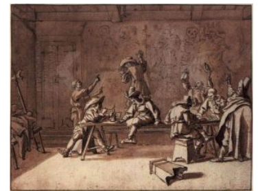
Fig 2. Pieter van Laer, The Bentveughels in a Roman Tavern , ca. 1630, brown ink and wash on paper, 20.3 x 25.8 cm, Kupferstichkabinet, Staatliche Museen zu Berlin, inv. 5239