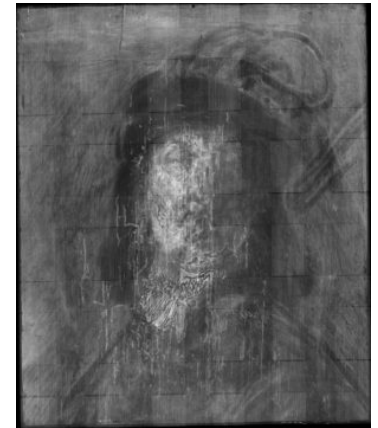
Fig 4. X-radiograph of JL-106