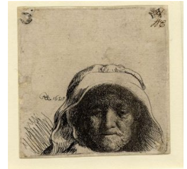
Fig 1. Rembrandt van Rijn, Rembrandt's Mother, 1628, etching, 64 x 64 mm, British Museum, London, F.6.122, 1843.0607.219