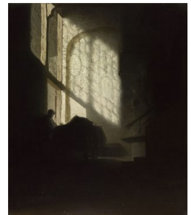
Fig 2. Circle of Rembrandt van Rijn, A Man Seated Reading at a Table in a Lofty Room , ca. 1628–29, oil on oak panel, 55.1 x 46.5 cm, The National Gallery, London, NG3214