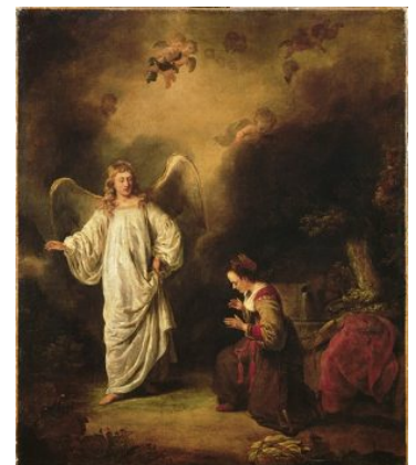
Fig 3. Ferdinand Bol, Hagar and the Angel , ca. 1650, oil on canvas, 115.6 x 100.5 cm, Walker Art Gallery, Liverpool