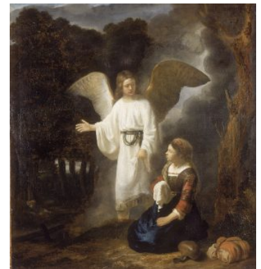
Fig 2. School of Rembrandt, The Angel Appearing to Hagar , ca. 1658–59, oil on canvas, 109.5 x 100.5 cm, Walker Art Gallery, Liverpool