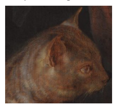
Fig 1. Detail of cat's head, Cat Crouching on the Ledge of an Artist's Atelier, GD-108