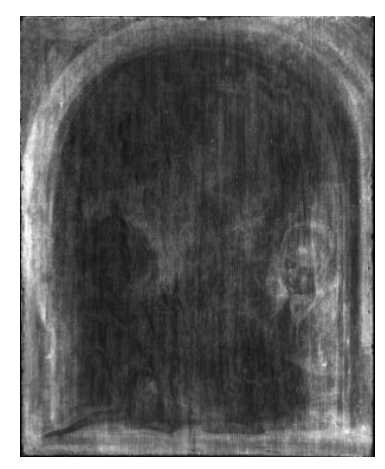
Fig 2. X-radiograph of Cat Crouching on the Ledge of an Artist's Atelier, GD-108