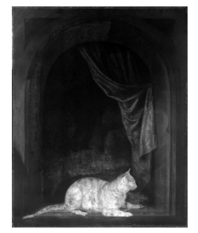
Fig 4. Infrared reflectogram of Cat Crouching on the Ledge of an Artist's Atelier , GD-108

The prominent red curtain, beautifully depicted with subtle violet highlights shimmering in the cascading of light across the iridescent fabric, also relates to the painting's underlying concern for the interrelationship of illusion and reality. The depiction of such a dazzling curtain evokes the famous story