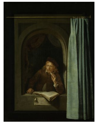
Fig 11. Gerrit Dou, Painter with Pipe and Book , ca. 1645, oil on panel, 48 x 37 cm, Rijksmuseum, Amsterdam, SK-A-86