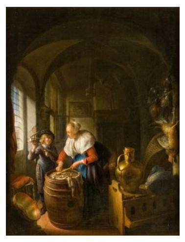
Fig 12. Gerrit Dou, The Mousetrap , ca. 1650, oil on panel, 47 x 36 cm, Musée Fabre, Montpellier, © Musée Fabre — Montpellier Agglomération / cliché F. Jaulmes