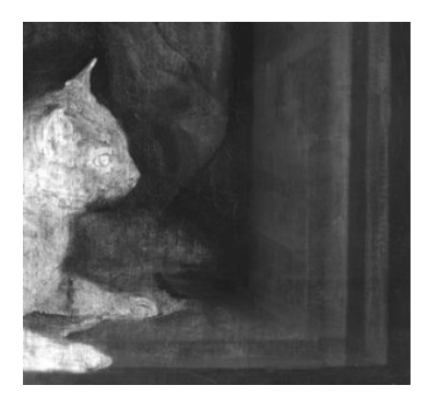
Fig 5. Detail of infrared reflectogram of Cat Crouching on the Ledge of an Artist's Atelier , GD-108, showing silhouette of what appears to be a mousetrap in the lower right corner