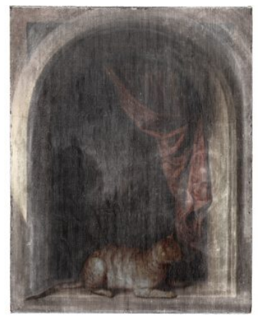
Fig 3. X-radiograph of Cat Crouching on the Ledge of an Artist's Atelier , GD-108, with X-ray superimposed in registration with the visual image (composite: John Twilley)