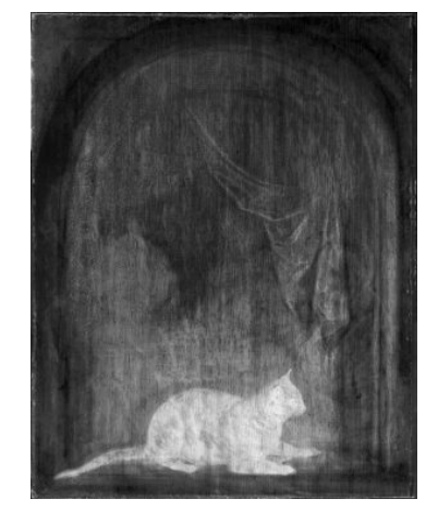
Fig 7. Infrared photograph superimposed on X-radiograph with inverted density grayscale of Cat Crouching on the Ledge of an Artist'

Atelier, GD-108