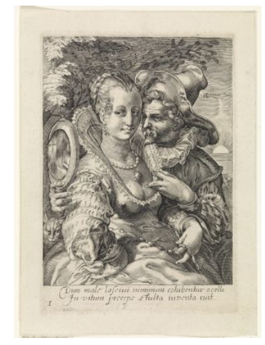
Fig 9. Jan Saenredam, after Hendrick Goltzius, Sight, ca. 1595–96, engraving, 177 x 124 mm, Rijksprentenkabinet, Rijksmuseum, Amsterdam, RP-P-1884-A-7717