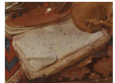
Fig 2. Detail of sketchbook in Jacob Toorenvliet, Allegory of Painting (JT-106)