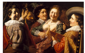
Fig 14. Jan Lievens, Allegory of the Five Senses , ca. 1622, oil on panel, 78.2 x 124.4 cm, private collection