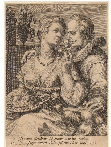
Fig 11. Jan Saenredam after Hendrick Goltzius, The Sense of Smell , ca. 1595, engraving, 173 x 123 mm, National Gallery of Art, Washington D.C., Rosenwald Collection, 1943.3.4640