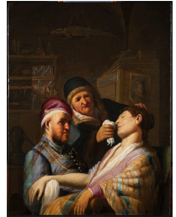
Fig 7. Rembrandt van Rijn, Unconscious Patient (Allegory of Smell) , RR-111, with eighteenth-century addition (after restoration)

Three Musicians (Allegory of Hearing) similarly depicts an evening scene, but in this instance one illuminated by an unseen light source. In this joyful image, two elderly singers, one male and one female, are joined by a young man who peers down over their shoulders at the large open music book. The bald man, with pronouncedly wrinkled forehead and eyeglasses balanced on the tip of his nose, guides their song with the beat of his raised hand as the old woman, with an equally wrinkled face, leans forward enthusiastically to join him in song. [16] The comedy here resides in the advanced age of the two primary singers, for generally images of Allegory of Hearing ( fig 10 ) depict young lovers singing and playing instruments together. Even at their advanced age, however, the couple's full engagement in the music seems to allude to the ideals of living a balanced and harmonious life. The man's fur-lined tabard and the woman's colorful turban are not contemporary attire, and help indicate the allegorical character of the scene. [17]