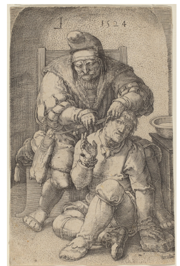
Fig 9. Lucas van Leyden, The Surgeon , 1524, etching, 11.7 x 7.6 cm, National Gallery of Art, Gift of the Estate of Leo