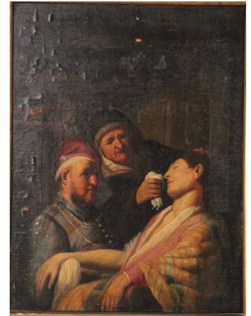
Fig 1. Rembrandt van Rijn, Unconscious Patient ( Allegory of Smell ), RR-111 (panel with eighteenth-century additions before restoration)

Soon after the acquisition of the Allegory of Smell in September 2015, Rembrandt's monogram, RHF, was discovered on a drawing of a man