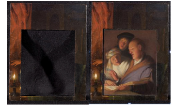
Fig 16. Eighteenth-century addition, formerly for Rembrandt van Rijn, Three Musicians (Allegory of Hearing) , RR-105

At the time that Rembrandt executed the Leiden Collection's panels, Lievens had been painting independently in Leiden for nearly four years. Jan Orlers, who knew Lievens well, records that the young artist returned from his apprenticeship with Pieter Lastman in 1621. Nevertheless, Lievens probably continued his training in Utrecht, since his paintings from 1622–24 fully reflect the latest artistic achievements of Van Honthorst and the other Utrecht Caravaggisti. [38] Rembrandt completed his own three-