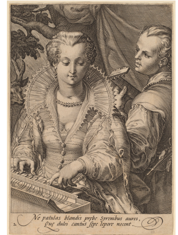
Fig 10. Jan Saenredam after Hendrick Goltzius, The Sense of Hearing , ca. 1595, engraving, 173 x 123 mm, National Gallery of Art, Washington D.C., Rosenwald Collection, 1943.3.4640