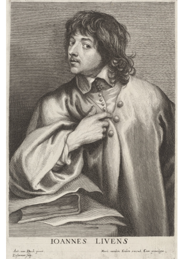
Fig 13. Lucas Vorsterman, after Sir Anthony van Dyck, Portrait of Jan Lievens , c. 1632, engraving, 24.1 x 15.8 cm., from the Iconography , National Gallery of Art, Washington