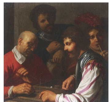
Fig 15. Jan Lievens, Tric Trac Players , 1624/25, oil on panel, 98 x 106 cm, Spier Collection, London