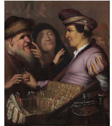
Fig 4. Rembrandt van Rijn, Spectacles Seller (Allegory of Sight) , ca. 1624 oil on panel 21 x 17.8 cm (8 ¼ x 7 in Museum De Lakenhal, Leiden, S 5697

Patients being bled were generally portrayed with their lower arm exposed, exactly as in the image of another bloodletting ( fig 8 ). [12] Once pricked with a lancet (a two-edged surgical knife or blade with a sharp point), the blood would drip into a bowl often held by an assistant. Occasionally patients would faint at the end of a bloodletting, a condition deemed to indicate the