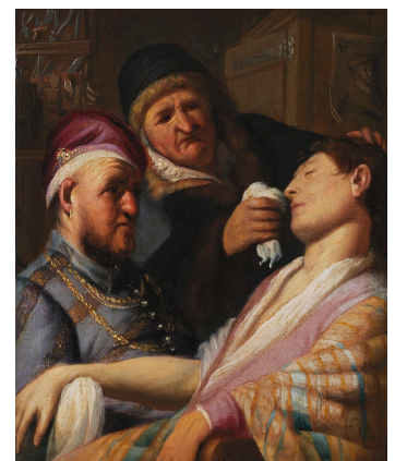
Fig 6. Rembrandt van Rijn, Unconscious Patient (Allegory of Smell) , RR-111, without eighteenth-century addition (after restoration)