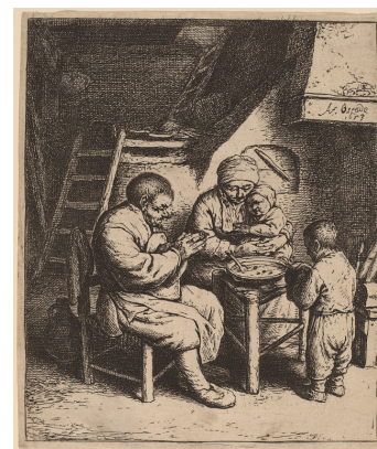
Fig 1. Adriaen van Ostade, Prayer before the Meal , 1653, etching (state ii/iv), 15.3 x 13 cm, National Gallery of Art, Washington D.C., Rosenwald Collection, 1943.3.8309

The earliest of Jan Steen's four representations of this subject, this scene belongs to a long-established iconographic tradition. [7] Early seventeenth-century paintings and prints reflect the ideal of a pious, harmonious and fertile family life that had developed within Dutch society, an ideal also expressed in the writings of Jacob Cats (1577–1660). Protestant and Catholic families alike commissioned portraits of themselves praying before a meal. [9] Artists frequently alluded to harmony and fertility by including biblical texts, [10] especially the third verse of Psalm 128 (127 in the Catholic Bible): "Thy wife shall be as a fruitful vine by the sides of thine house." [11] The grapevine climbing around the window above the mother indicates that Steen also consulted Psalms. Steen's scene resembles