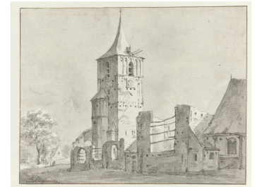
Fig 2. Circle of Jan Beerstraeten, The Church of Warmond , ca. 1660, black chalk, gray wash, 175 x 225 mm, Rijksmuseum, Amsterdam, RP-T-1879-A-22

Dancing before an Inn , ca. 1647, panel, 38.5 x 56.5 cm, Mauritshuis, The Hague, inv. 553