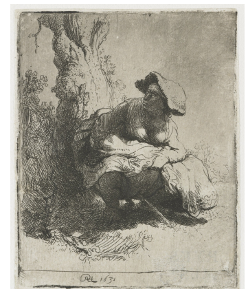
Fig 4. Rembrandt van Rijn, Woman Urinating , 1631, etching, 81 x 64 mm, Rijksmuseum, Amsterdam, RP-P-OB-637