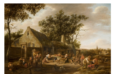
Fig 1. Jan Steen, Peasants

This large painting from the last years of Jan Steen's remarkable career is one of the master's most expansive depictions of a country fair. The merrymaking takes place beneath tall trees in front of an inn, to the right of which, at some remove, are market stalls and a castle gate. The flag hanging from the tower window of a distant church was a signal that a fair was being celebrated that very day. In the midst of the festivities are two