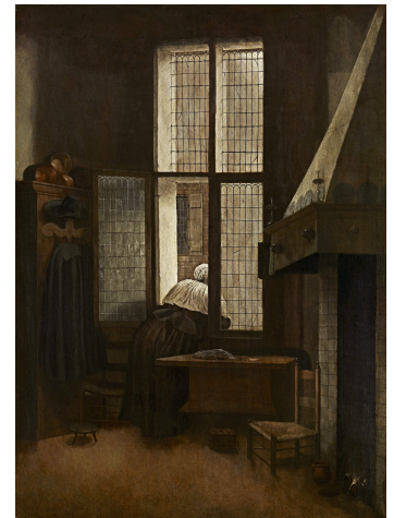
Fig 4. Left: Jacob Vrel, Woman Looking Out of a Window , 1654, oil on panel, 66 x 47.5 cm, Kunsthistorisches Museum, Gemäldegalerie, Vienna, inv. 6081; and right: Jacob Vrel, An Interior with a Sick Woman by a Fireplace (JV-100), 1928 photograph showing extended format