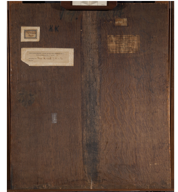
Fig 3. Left: reverse of Jacob Vrel, An Interior with a Sick Woman by a Fireplace (JV-100), and right: reverse of the panel in Vienna