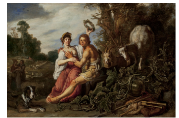
Fig 6. Pieter Lastman, Paris and Oenone , 1619, oil on panel, 48.9 x 71.4 cm, Worcester Art Museum, Gift of Mr. and Mrs. John Adam, inv. no. 1984.39.