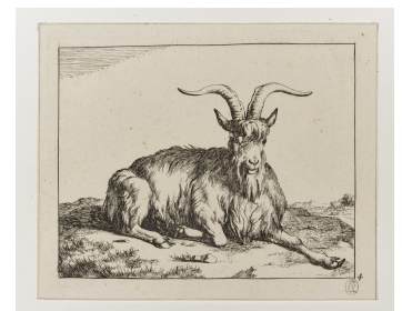
Fig 3. Marcus de Bijé after Paulus Potter, Recumbent Goat, 1654–88, engraving, 117 x 147 mm, Museum Boijmans van Beuningen, Rotterdam, inv. BdH 1138 (PK)