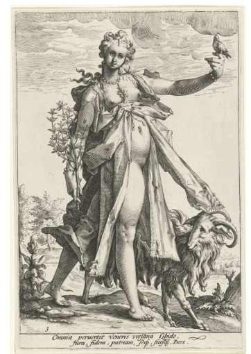
Fig 7. Jacob Matham after Hendrick Goltzius, Libido (Luxuria) , 1585–89, engraving, 216 x 144 mm, Rijksprentenkabinet, Rijksmuseum, Amsterdam, inv. RP-P-OB-27.227