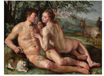
Fig 5. Hendrick Goltzius, Fall of Man , 1616, oil on canvas, 104.5 x 138.4 cm, National Gallery of Art, Washington D.C., Patrons' Permanent Fund, 1996.34.1