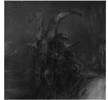
Fig 1. Detail of infrared photograph of GD-114, showing the changes made around the position of the goat's head

The associations of the goat with lust and promiscuity, which go back to classical antiquity, were also evident in the writings of Karl van Mander (1548–1606). In his Het Schilder-Boeck of 1604, Van Mander described the goat as unchaste and ruinous, likening this animal, which bites off and destroys young green buds of plants, to a whore who ruins young men. [6] Hendrick Goltzius (1558–1617) alluded to the symbolism of lust associated with goats in his 1616 Fall of Man in the National Gallery of Art,