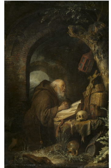
Fig 2. Gerrit Dou, The Hermit , 1670, oil on oak panel, 46 x 34.5 cm, National Gallery of Art, Washington D.C., Timken Collection, 1960.6.8