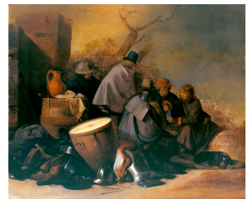
Fig 3. Gerard ter Borch, An Encampment of Soldiers Playing Cards, ca. 1640–45, oil on panel, 41.6 x 51 cm, Staatliche Museen zu Berlin–Preußischer Kulturbesitz, Gemäldegalerie, Berlin, inv. 2081