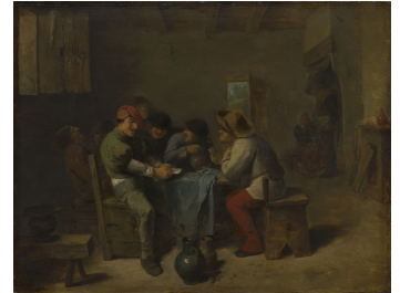
Fig 2. Adriaen Brouwer, Peasants and Soldiers Playing Cards , ca. 1631–32, oil on panel, 33 x 43 cm, Alte Pinakothek, Munich, inv. 218