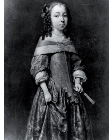
Fig 2. Attributed to Caspar Netscher, Portrait of Wilhelmina Everwijn (1649–1737), ca. 1658, oil on copper, 28 x 23 cm, present whereabouts unknown (art dealer A. Brod, London 1958)